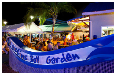
Oistins Fish Fry