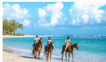
Horse Back Riding