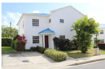
Rowans Town House