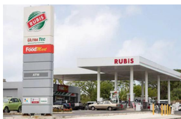
Rubis Gas Station