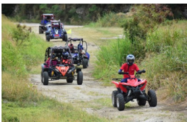
Off Road Fury