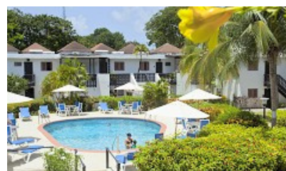
Rockley Golf Club