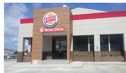
American Food Chains